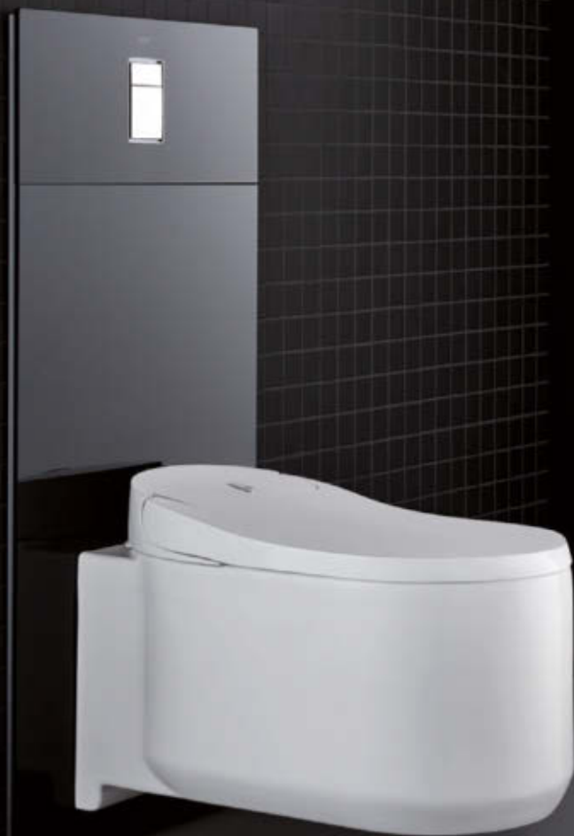
39 374 KS0 Glass Cover Skate Cosmopolitan Velvet Black