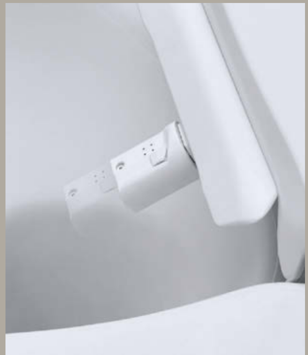
Adjustable shower arm position.

your ideal spray position. Adapt the exact spray arm position for great performance every time.